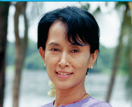
Aung San Suu Kyi 1945–

Aung San Suu Kyi won the Nobel Peace Prize in 1991 for her efforts to establish democracy in Myanmar. She could not accept the award in person, however, because she was still under house arrest.